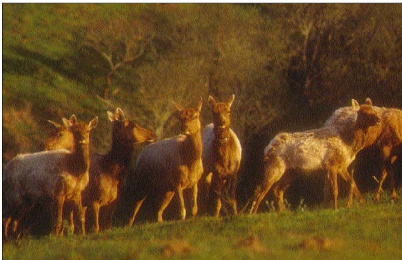
Tule elk ( Cervus elaphus nannodes ) is a subspecies of elk native to California. In 1978 tule elk were restored to Point Reyes National Seashore after being absent from the area for over 100 years.

Information on tule elk reproductive and mortality rates is critical to accurately understand the underlying factors influencing the population dynamics of this species. Radio-marking is currently the most effective method of monitoring individual animals in a free-ranging situation to determine population parameters. Radio telemetry collars were fitted onto adult female elk. Blood was taken at capture to determine pregnancy status. Radio collared elk were monitored regularly to determine their locations and survival rates. Fecal samples from collared elk have been biannually tested for Johne's disease, an exotic diarrheal wasting disease previously identified in the elk population. A sample of tule elk calves were fitted with radio telemetry collars and monitored for the first year of their lives to determine neonatal and calf survival rates.